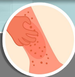
SORES ON SKIN